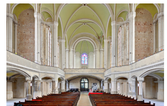
Viewing direction to the entrance, 1st floor: 600 m 2