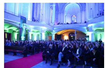
Example for an event