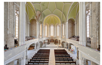
Viewing direction to the apse + gallery, ground and 1st floor: 600 + 450m 2