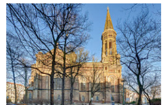
Exterior view Zion's Church

Smoking is prohibited in the buildings. Candles are permitted only in fireproof vessels containing sand or water.