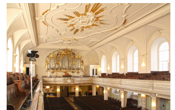
Gallery: Viewing direction to the organ