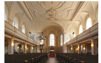
Viewing to the apse, 1st floor: 500m 2