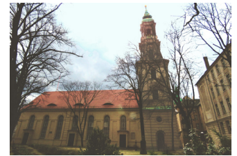
Exterior view of the Sophien Church

As of 10 pm, a law regarding neighborhood noise reduction is in effect. Between 10 pm and 8 am deliveries, as well as any driving on the premises are prohibited. Smoking is prohibited in all of the buildings. Candles are permitted only in fireproof vessels containing sand or water.